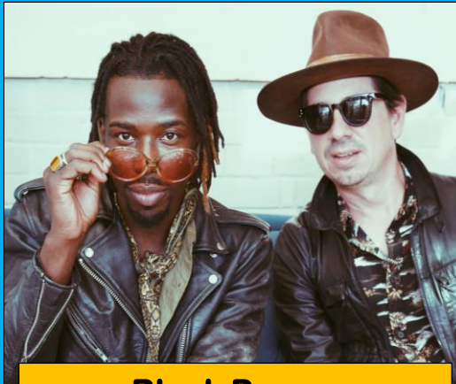
Black Pumas Performances at 1:00 PM & 3:00 PM PST