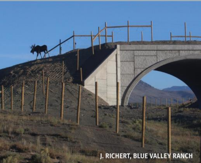
J. RICHERT, BLUE VALLEY RANCH