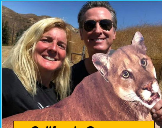
California Governor Gavin Newsom 11:30 AM PST

Featuring special guest appearances, cool wildlife videos, musical performances and more! Highlights of the stage program below.