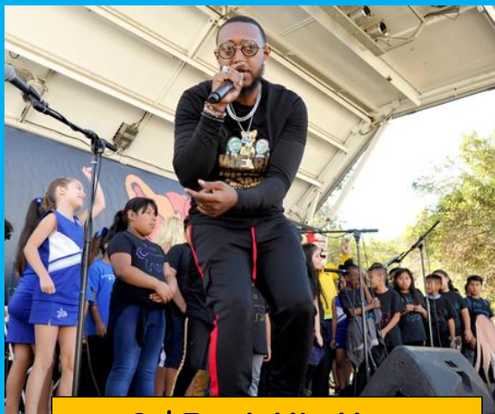
3 rd Rock Hip Hop Performances at NOON & 2:00 PM PST