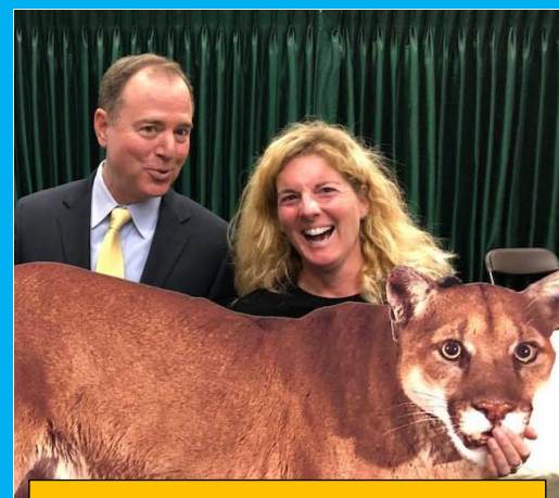
Congressman Adam Schiff 12:30 PM & 2:30 PM PST

BE SURE TO CHECK THE WALKS & TALKS ZONE AT THE FESTIVAL FOR A SCHEDULE OF AMAZING PRESENTATIONS FROM WILDLIFE LEADERS!