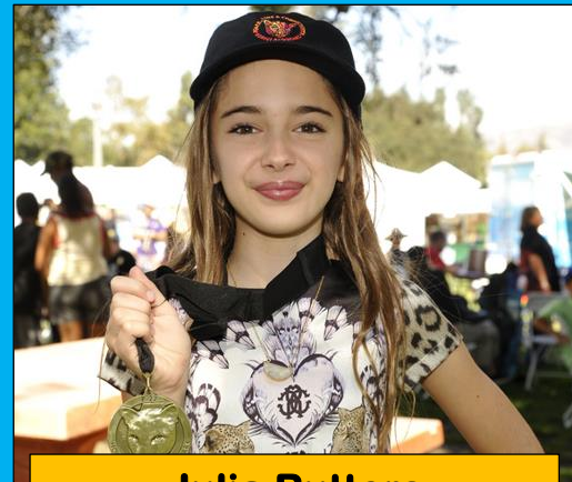
Julia Butters Actress 1:30 PM & 3:30 PM PST